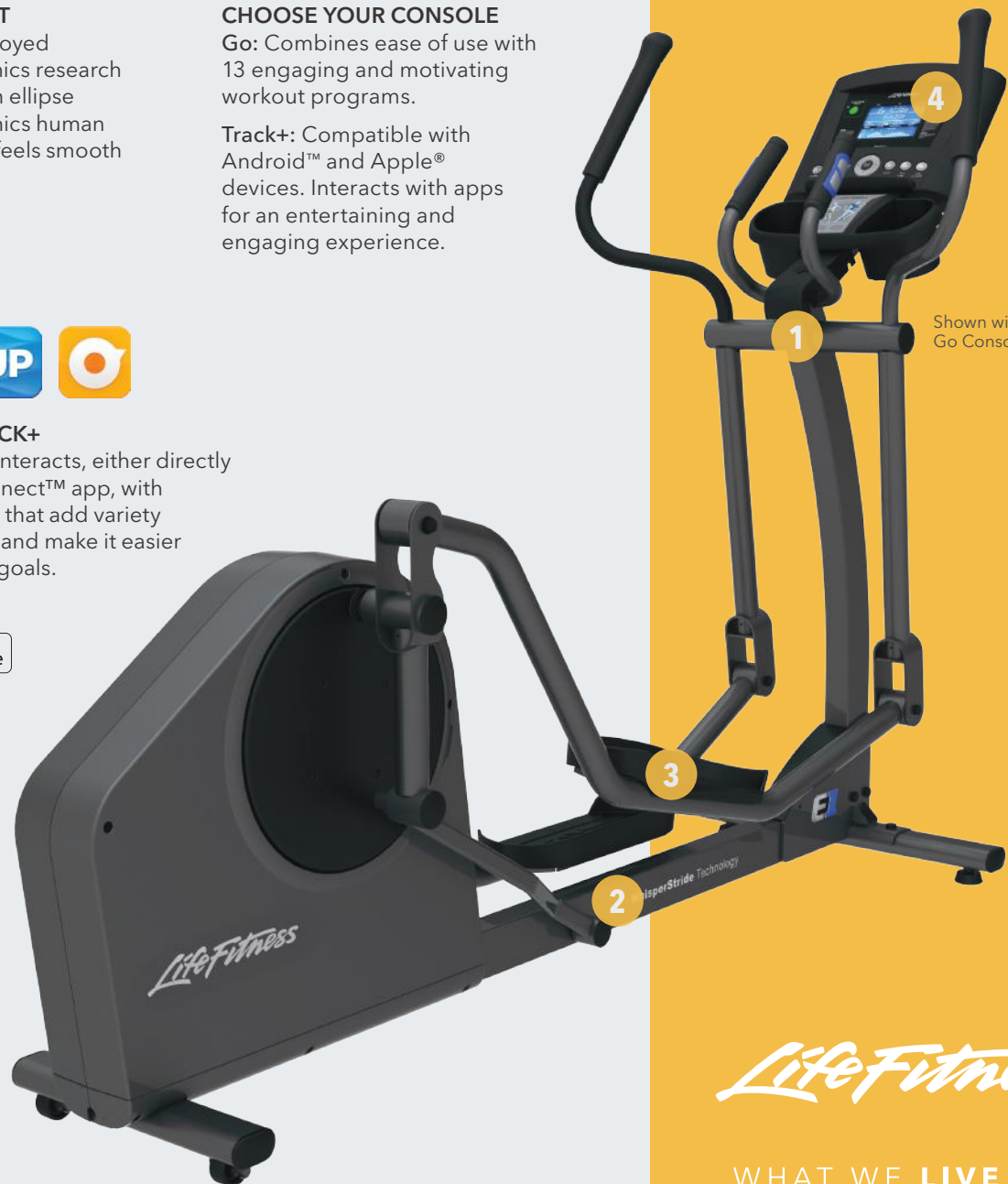
Shown with Go Console

The E1 Cross-Trainer offers an effective low-impact, total-body workout for home exercisers of all fitness levels. Years of Life Fitness innovation and research have resulted in an inviting cross-trainer that combines a comfortable, natural feel with outstanding durability and quiet operation.