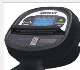
LCD Digital Display