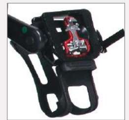
Optional Dual-Clip Foot Pedal