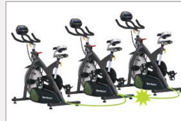
Connect Multiple Units