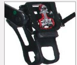
Dual-Clip Foot Pedal