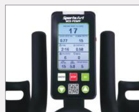
LCD Digital Display