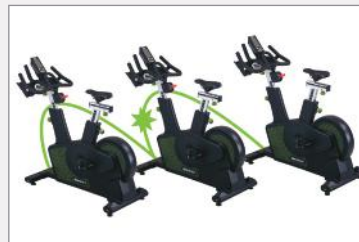
Connect Multiple Units