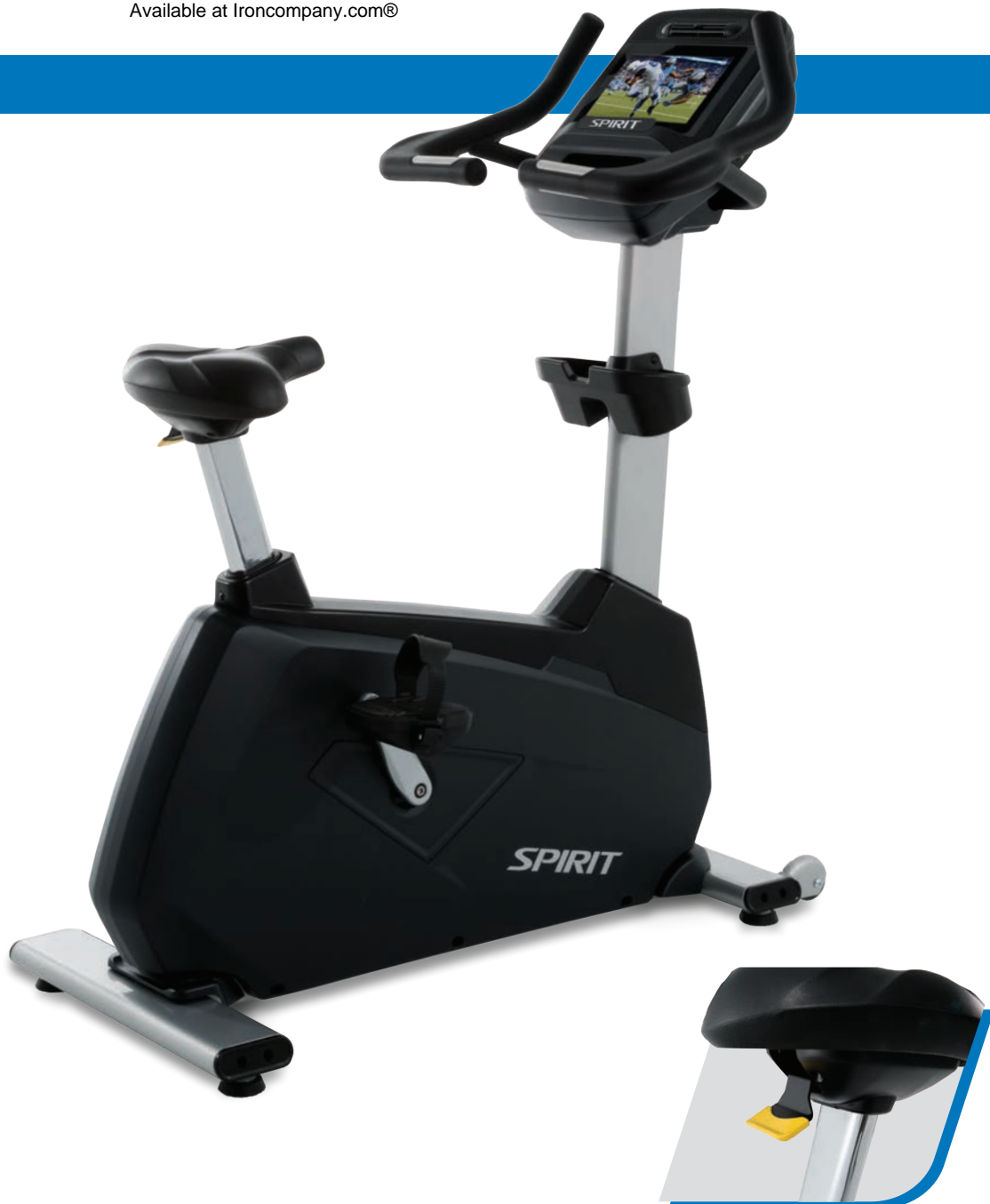
Easy Seat Adjustment

Users get the best of both in motivation and entertainment with the CU900ENT Upright Bike. The 10.1" touchscreen display allows users to watch TV, surf the internet and stream music while they work out. Three workout display modes give users plenty of feedback on their performance and progress. Commercial-grade pedals, cranks and bearings provide outstanding function and durability.